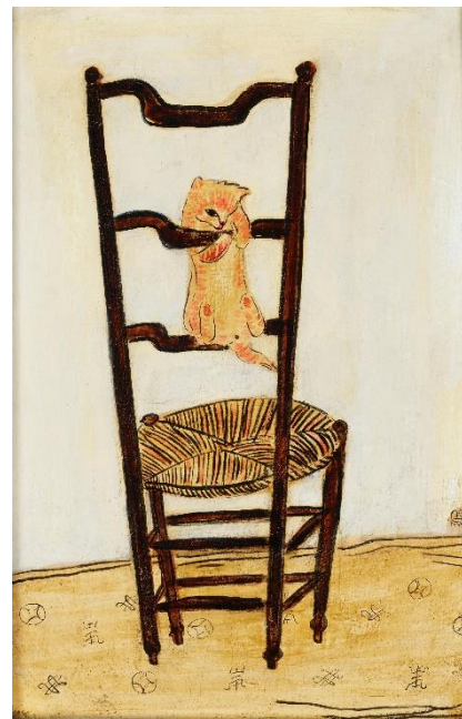
20 th Century Art Day Sale SANYU (CHANG YU, 1895 –1966) Kitten Clambering up a Chair; & Nude (double sided) oil on masonite in the original artist frame (front); oil on paper laid on masonite (reverse) image: 50.7 x 33.4 cm (20 x 13 1/8 in.) framed: 51.1 x 34.7 cm. (20 1/8 x 13 5/8 in.) Painted in the 1930s Estimate: HK$10,000,000 – 18,000,000