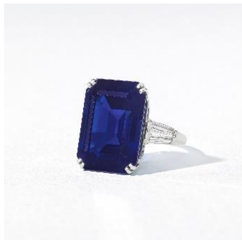
21.38 CARATS KASHMIR "ROYAL BLUE" SAPPHIRE RING Estimate: HK$12,000,000 – 18,000,000