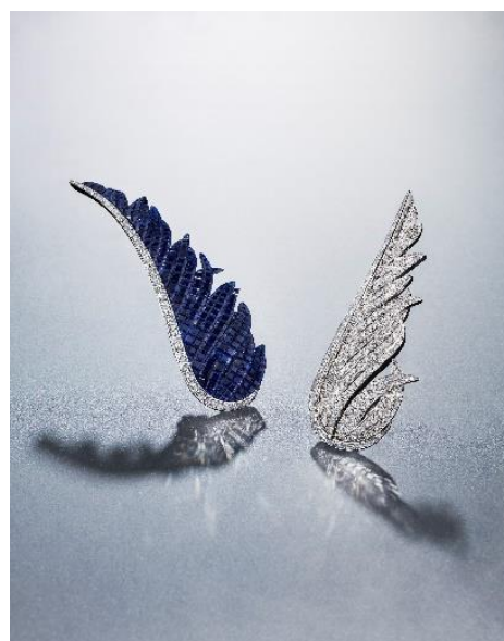
A PAIR OF VAN CLEEF & ARPELS SAPPHIRE AND DIAMOND "MYSTERY SET" BROOCHES Estimate: HK$2,400,000 - 3,500,000