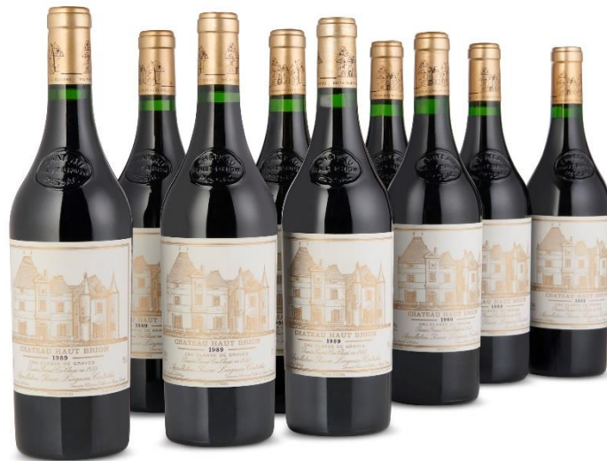
Chateau Haut-Brion 1989 12 bottles per lot Estimate: HK$ 180,000 – 260,000