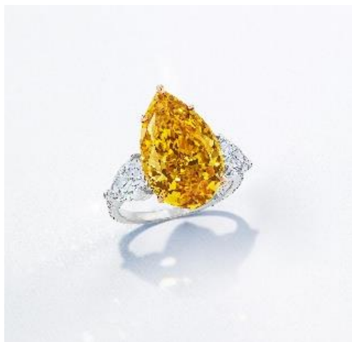
THE GOLDEN FLAME 8.92 CARATS FANCY VIVID YELLOW-ORANGE INTERNALLY FLAWLESS DIAMOND RING Estimate: HK$20,000,000 – 30,000,000