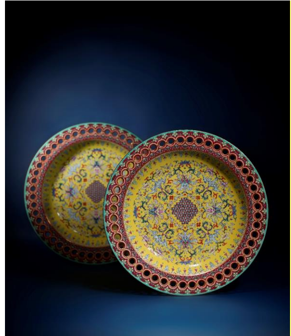
Property of A Lady A Fine And Exceptionally Rare Pair Of Yellow-Ground Famille Rose Pierced Rim Dishes Qianlong Six-Character Iron-Red Seal Marks And Of The Period (1736-1795) 15 ½ in. (39.3 cm.) diam