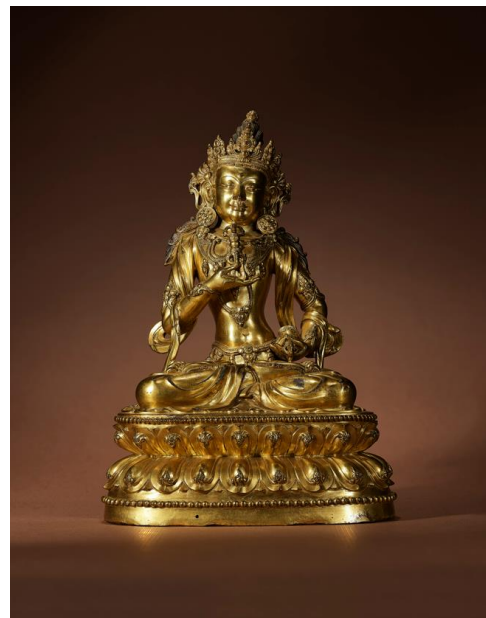
The Property Of A Private Swiss Collector A Gilt-Bronze Figure Of Vajrasattva Xuande Incised Six-Character Presentation Mark And Of The Period (1403-1425) 10 in. (26.5 cm.) high