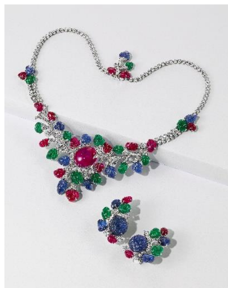
CARTIER MULTI-GEM "TUTTI FRUTTI" NECKLACE & EARRINGS Necklace Estimate: HK$2,400,000 - 3,500,000 Earrings Estimate: HK$400,000 - 600,000