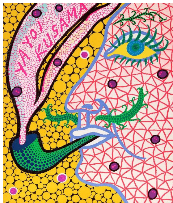
21 st Century Art Day Sale YAYOI KUSAMA (B. 1929) Fantasizing in the Smoke acrylic on canvas 45.6 x 38.3 cm. (18 x 15 1/8 in.) Painted in 1989 Estimate: HK$6,800,000 – 9,800,000