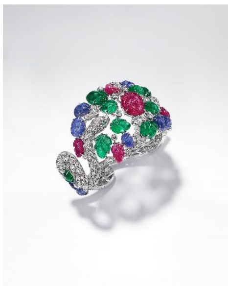
CARTIER MULTI-GEM "TUTTI FRUTTI" BANGLE Estimate: HK$3,200,000 - 5,000,000