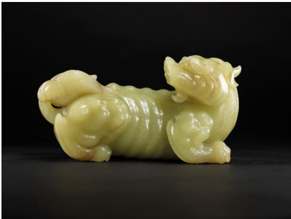
The Property Of A Gentleman A Large Yellow Jade Carving Of A Xiezhi Qianlong Period (1736-1795) 7.1/8 in. (18.1 cm.) long, box