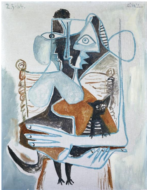
20 th / 21 st Century Evening Sale PABLO PICASSO (1881-1973) Femme tenant un chat dans ses bras oil and Ripolin on canvas 116.2 x 89.5 cm. (45 3/4 x 35 1/4 in.) Painted on 2 May 1964 Estimate: HK$38,000,000 – 45,000,000