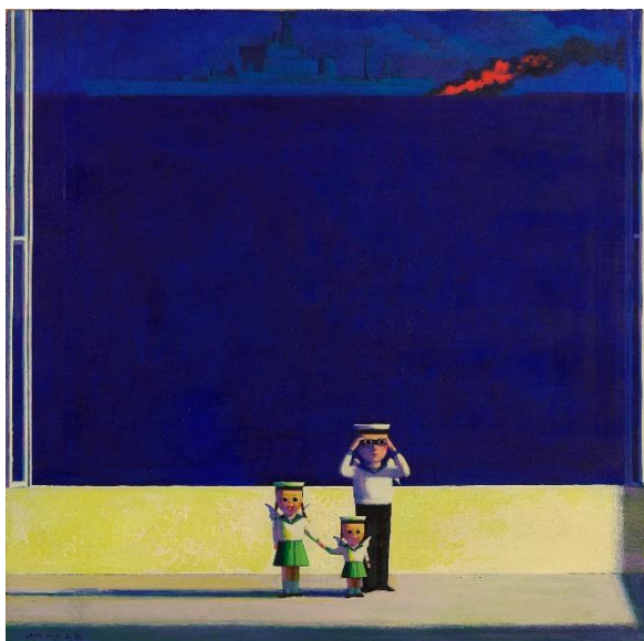
20 th / 21 st Century Evening Sale LIU YE (B. 1964) Room of the Sea acrylic and oil on canvas 90 x 90 cm. (35 3/8 x 35 3/8 in.) Painted in 2000 Estimate: HK$8,000,000 – 15,000,000