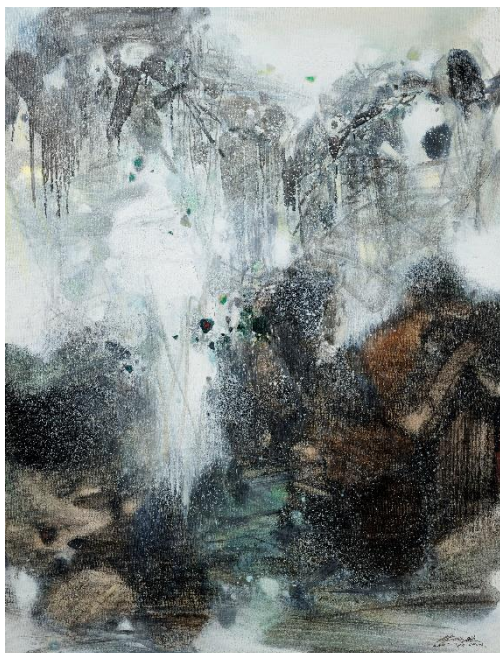
20 th / 21 st Century Evening Sale CHU TEH-CHUN (ZHU DEQUN, 1920-2014) Frimas I oil on canvas 116 x 89 cm. (45 5/8 x 35 in.) Painted in 1986 Estimate: HK$7,000,000 – 10,000,000