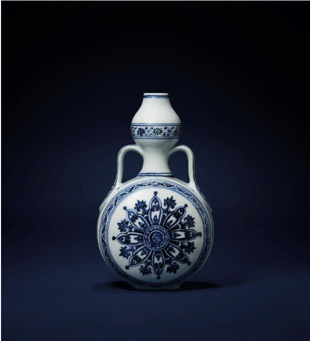
Property Of A Lady A Fine Rare Blue And White Moonflask Yongle Period (1403-1425) 10 ¼ in. (25.7 cm.) high