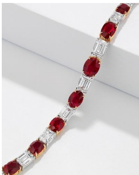
BURMESE "PIGEON'S BLOOD" RUBY AND DIAMOND BRACELET Estimate: HK$18,000,000 - 28,000,000