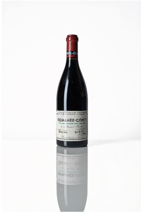
Domaine de la Romanée-Conti, Romanée-Conti 1999 3 bottles per lot Estimate: HK$450,000 – 700,000