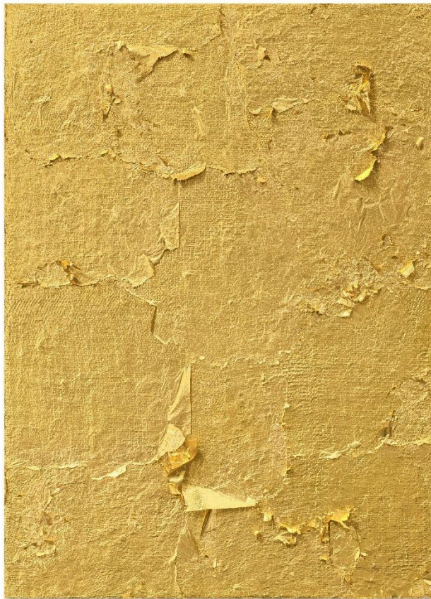
Yves Klein (1928-1962) Âge d'or Monogold (MG36) , gold leaf on panel, 22.5 x 16 cm, 1959, Estimate: €1,000,000 - 1,500,000