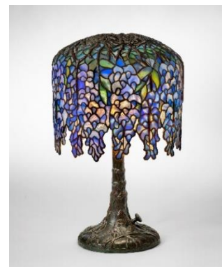
LOT 166 TIFFANY STUDIOS Rare 'Pony Wisteria' Table Lamp, circa 1915 Estimate: $200,000-300,000