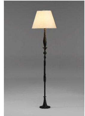
LOT 60 ALBERTO GIACOMETTI (1901-1966) 'Grande Feuille' Floor Lamp, designed circa 1933-34 Estimate: $300,000-500,000