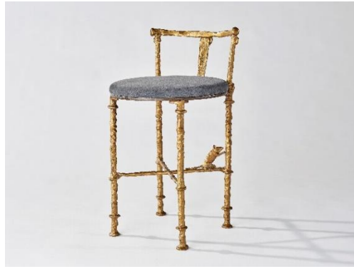
LOT 58 DIEGO GIACOMETTI (1902-1985) Tabouret de Coiffeuse à la Souris, designed circa 1960 Estimate: $150,000-200,000