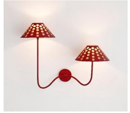
LOT 1 JEAN ROYÈRE (1902-1981) Rare 'Champignon' Sconce, circa 1945 Estimate: $30,000-50,000