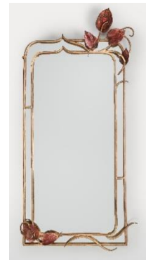
LOT 29 CLAUDE LALANNE (1925-2019) 'Hosta' Mirror, 2012 Estimate: $500,000-700,000