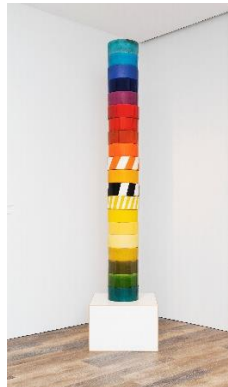
LOT 93 ETTORE SOTTASS (1917-2007) Unique and Important 'Menhir della Vita', 1966 Estimate: $200,000-300,000