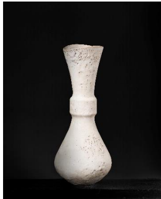
LOT 75 LUCIE RIE (1902-1995) Important Tall Vase with Collar, 1984 Estimate: $30,000-50,000