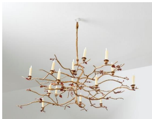
LOT 23 CLAUDE LALANNE (1925-2019) Unique 'Structure Végétale' Chandelier, 2013 Estimate: $1,000,000-1,500,000