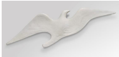
LOT 64 ALBERTO GIACOMETTI (1901-1966) 'Oiseau', designed circa 1937 Estimate: $200,000-300,000