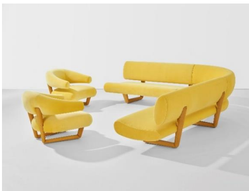
LOTS 8 & 9 JEAN ROYÈRE (1902-1981) Pair of 'Sculpture' Armchairs, circa 1955 Estimate: $300,000-500,000 Rare 'Sculpture' Sofa, circa 1955 Estimate: $300,000-500,000