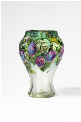
LOT 164 TIFFANY STUDIOS Important and Rare 'Morning Glory' Paperweight Vase, circa 1913 Estimate: $70,000-100,000