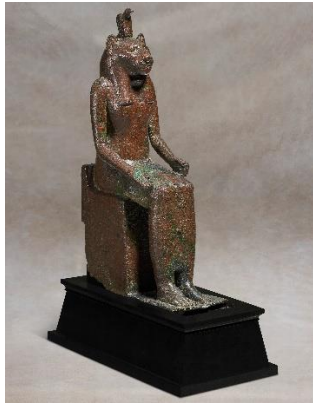
AN EGYPTIAN BRONZE LION-HEADED GODDESS LATE PERIOD, 26TH DYNASTY, 664-525 B.C. 11 7/8 in. (30.1 cm.) high $150,000-250,000

The sale is led by a rare Egyptian nummulitic limestone figure of an Amarna princess , from the New Kingdom and a large Egyptian Bronze Lion-Headed Goddess from the Estate of Joan R. Linclau. Other highlights include a Roman Marble Herm Portrait of the Philosopher Theophrastos , and an Attic Red-Figured Column-Krater depicting the abduction of Oreithyia by Boreas.