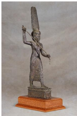
PROPERTY SOLD TO BENEFIT THE DINA AND RAPHAEL RECANATI FAMILY FOUNDATION AN EGYPTIAN GOLD-INLAID BRONZE ONURIS LATE PERIOD, 664-332 B.C. 10 7/8 in. (27.6 cm.) high $30,000-50,000