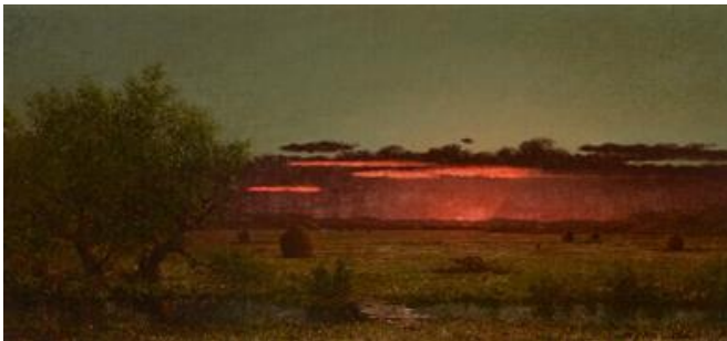
19 th CENTURY AMERICAN ART Property from the May Family Collection MARTIN JOHNSON HEADE (1819-1904) Jersey Meadows at Sunset signed 'MJ Heade' oil on canvas 14 1/4 x 30 1/4 in. (36.2 x 76.8 cm.) Painted circa 1866-76. $600,000-800,000