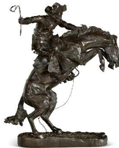
FREDERIC REMINGTON (1861-1909) Broncho Buster inscribed 'Frederic Remington.' and 'CAST BY THE HENRY- BONNARD BRONZE Co N-Y. 1895.'—inscribed 'Copyrighted by/Frederic Remington 1895.'— numbered '46.' bronze with brown patina 24 in. (60.9 cm.) high Modeled in 1895; cast in 1900. $250,000-350,000