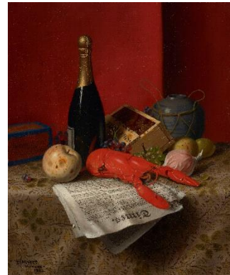
WILLIAM MICHAEL HARNETT (1848-1892) Still Life with Lobster, Fruit, Champagne and Newspaper signed and dated 'Wm Harnett./München./1882.' oil on canvas 10 x 8 1/4 in. (25.4 x 20.9 cm.) Painted in 1882. $100,000-150,000

Images for press use available on request.