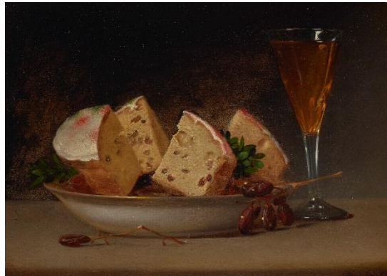
RAPHAELLE PEALE (1774-1825) Currants and Biscuits signed and indistinctly dated 'Peale 1813' oil on panel 7 1/2 x 10 1/2 in. (19.1 x 26.7 cm.) Painted in 1813. $120,000-180,000