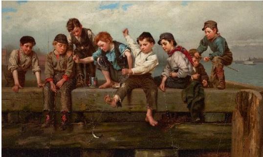
Property from a Prominent Private Collection JOHN GEORGE BROWN (1831-1913) A Thrilling Moment signed and dated 'J.G. Brown. N.A./N.Y. 1880.' oil on canvas 24 x 40 in. (60.9 x 101.6 cm.) Painted in 1880. $200,000-300,000

The sale is anchored by two noteworthy collections – Property from the May Family Collection and Property from a Southern Estate. The May Family Collection includes important works by Martin Johnson Heade, Alfred Jacob Miller, and Alfred Thompson Bricher. Property from a Southern Estate features important examples by William Merritt Chase and William J. McCloskey. The auction will also include an important Winslow Homer of the Adirondacks; historical Western art by Frederic Remington and Albert Bierstadt; a significant painting by J.G. Brown; and important works by Thomas Moran, James McNeil Whistler and Charles Ethan Porter.