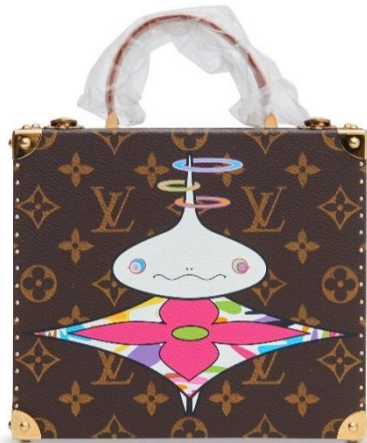
A LIMITED EDITION CLASSIC MONOGRAM CANVAS SUPERFLAT JEWELLERY BOX BY TAKASHI MURAKAMI LOUIS VUITTON, 2003