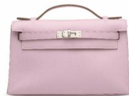
A MAUVE PALE SWIFT LEATHER KELLY POCHETTE WITH PALLADIUM HARDWARE HERMÈS, 2022