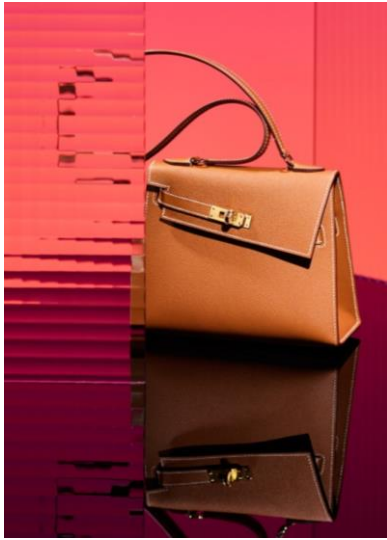
A LIMITED EDITION GOLD EPSOM LEATHER MINI DESORDRE KELLY 20 WITH GOLD HARDWARE HERMÈS, 2022

Also featured in this auction is an array of freshly produced Hermès bags from 2022, showcasing a variety of materials, styles, sizes, and colours, including: