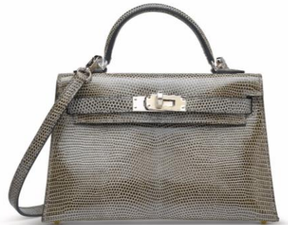
A SHINY GRIS FONCÉ NILOTICUS LIZARD MINI KELLY 20 II WITH PALLADIUM HARDWARE HERMÈS, 2022