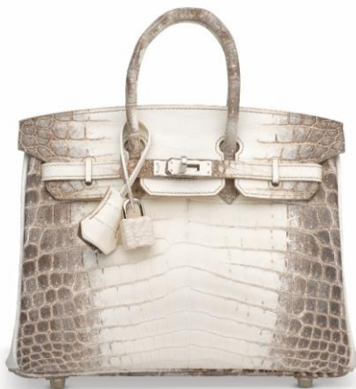
A RARE, MATTE WHITE HIMALAYA NILOTICUS CROCODILE BIRKIN 25 WITH PALLADIUM HARDWARE HERMÈS, 2022

The Hermès Himalaya Niloticus Crocodile handbags are highly sought-after luxury accessories known for their exclusivity, rarity, and exceptional craftsmanship. Crafted from premium Niloticus crocodile leather, these bags showcase a unique, gradient colouration inspired by the snow-capped peaks of the Himalayas. Featured in this sale are the iconic Birkin, Kelly, and Constance handbags, which combine timeless design and the prestige of the Hermès brand. Due to their scarcity in the market, their retention value is significant, making them a symbol of status and refined taste for those who can acquire them.