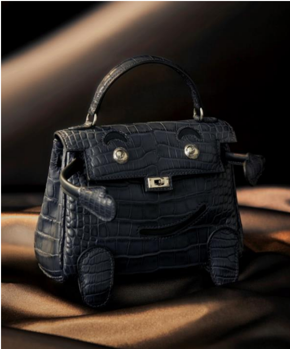
A LIMITED EDITION MATTE BLEU INDIGO ALLIGATOR & BLACK SWIFT LEATHER QUELLE IDOLE WITH PALLADIUM HARDWARE HERMÈS, 2021

The auction will also feature two exceptional Hermès Kelly Doll handbags. These limited edition, whimsical creations artfully combine the brand's iconic Kelly design with a playful, doll-like twist, featuring movable arms and a smiling face. Highly coveted by collectors and enthusiasts of unique luxury items, these meticulously crafted handbags showcase Hermès' renowned attention to detail and creative spirit. The sale will offer collectors a rare opportunity to acquire these conversation-starting pieces that encompass both personal style and the essence of Hermès, adding a truly remarkable touch to any collection.