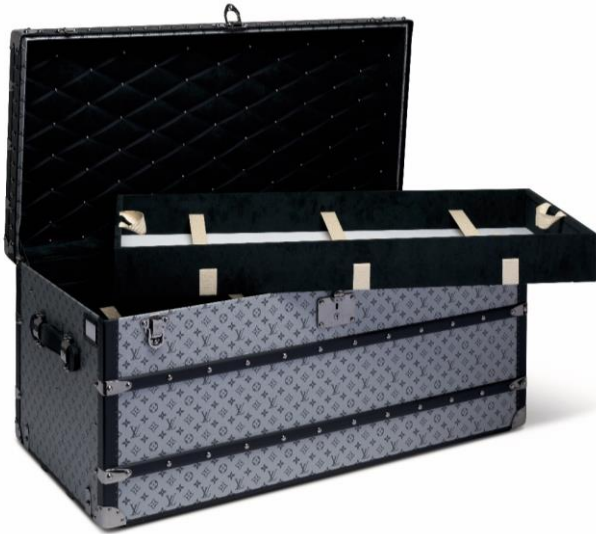
A REVERSE ECLIPSE MONOGRAM CANVAS COURRIER LOZINE TRUNK 110 WITH SILVER HARDWARE LOUIS VUITTON, 2018

This season's auction features Louis Vuitton trunks that epitomize luxury, heritage, superb craftsmanship, elegance, durability, functionality, and creativity. In addition to the unmistakable monogram canvas, a collaboration piece with Fragment Design is also on offer. Founded by Hiroshi Fujiwara, an internationally renowned Japanese streetwear designer, musician, and prominent influencer, Fragment Design brings a fresh perspective to the iconic Louis Vuitton trunk.