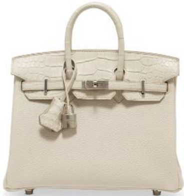
A LIMITED EDITION MATTE BÉTON ALLIGATOR & TOGO LEATHER TOUCH BIRKIN 25 WITH PALLADIUM HARDWARE HERMÈS, 2022