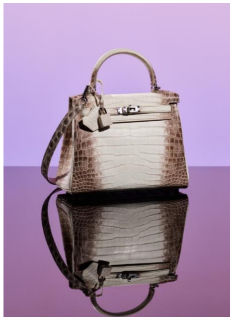
A RARE, MATTE WHITE HIMALAYA NILOTICUS CROCODILE RETOURNÉ KELLY 25 WITH PALLADIUM HARDWARE HERMÈS, 2022