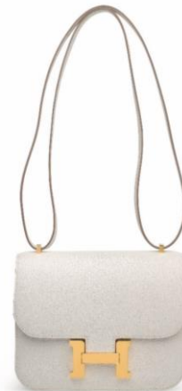
A LIMITED EDITION MUSHROOM & BISCUIT CHÈVRE LEATHER VERSO VERSO MINI CONSTANCE 18 WITH GOLD HARDWARE HERMÈS, 2022