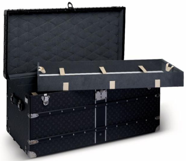
A LIMITED EDITION ECLIPSE MONOGRAM CANVAS COURRIER LOZINE TRUNK 110 WITH SILVER HARDWARE BY FRAGMENT DESIGN LOUIS VUITTON, 2017