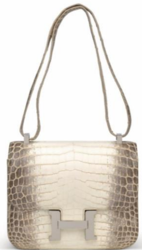
A RARE, MATTE WHITE HIMALAYA NILOTICUS CROCODILE CONSTANCE 24 WITH PALLADIUM HARDWARE HERMÈS, 2020