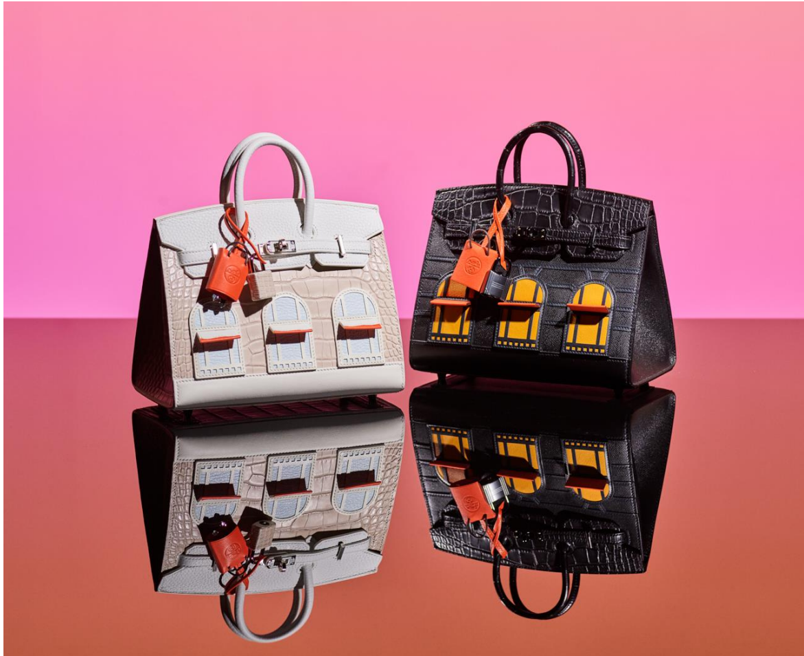
LEFT: A RARE, MATTE BÉTON ALLIGATOR, WHITE TOGO, SWIFT & SOMBRERO , ORANGE H & CRAIE SWIFT & BLEU BRUME CHÈVRE LEATHER SNOW FAUBOURG SELLIER BIRKIN 20 WITH PALLADIUM HARDWARE HERMÈS, 2022 ESTIMATE: HK$1,400,000 – 2,200,000