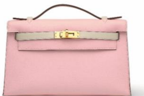
A CUSTOM ROSE SAKURA & NATA SWIFT LEATHER KELLY POCHETTE WITH GOLD HARDWARE HERMÈS, 2022