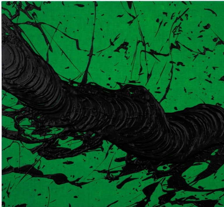
Le Bruit du Vent II (The Sound of Wind II) Fabienne Verdier, 2022 Acrylic and mixed media on canvas 50 x 46cm

Dubai - Christie's Middle East is delighted to announce Energy Lines: Fabienne Verdier , a selling exhibition featuring a newly produced body of works by acclaimed contemporary French artist Fabienne Verdier in collaboration with Custot Gallery Dubai . Taking place from 9 – 19 February at Christie's, DIFC, the exhibition will feature more than 15 works varying from monumental to smaller scale in this series, all of which serve as recollections, drawing inspiration from her memories of the natural world.