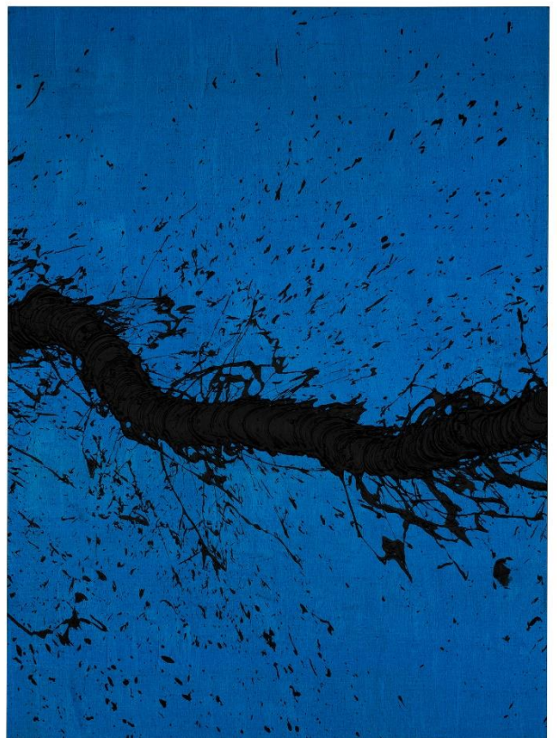
Escapade Nocturne (Nocturnal Escapade) Fabienne Verdier, 2022

Acrylic and mixed media on canvas 183 x 135cm