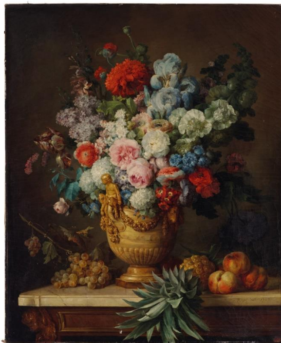
Anne Vallayer-Coster (1744-1818), Nature morte au vase de fleurs et ananas , oil on canvas, 1783, estimate: €600,000 - €1,000,000