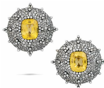
JAR SAPPHIRE, EMERALD DIAMOND 'FAN' EARRING estimate CHF400,000-600,000 | JAR AMETHYST, SAPPHIRE AND RUBY 'BONNET' RING estimate CHF70,000-100,000 | JAR COLOURED SAPPHIRE, COLOURED DIAMOND AND DIAMOND EARRINGS, estimate CHF2500,000-350,000