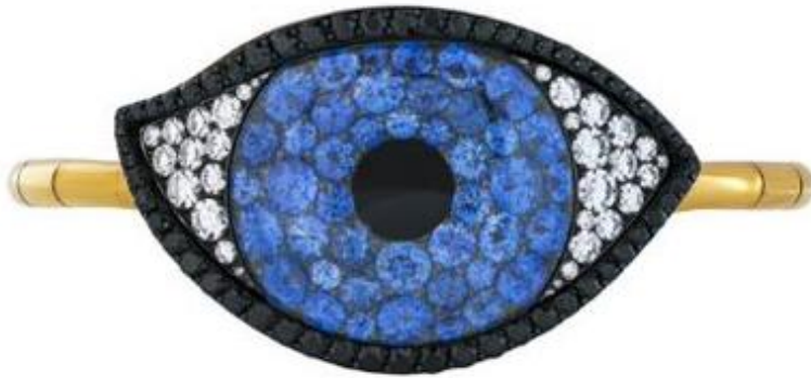
JAR SAPPHIRE, SPINEL AND DIAMOND 'EYE' BANGLE, estimate US$150,000-250,000