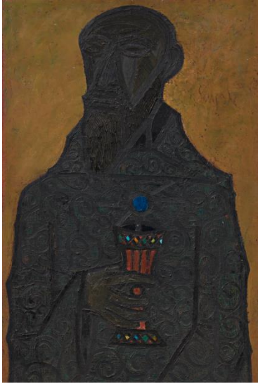
FRANCIS NEWTON SOUZA (1924-2002)