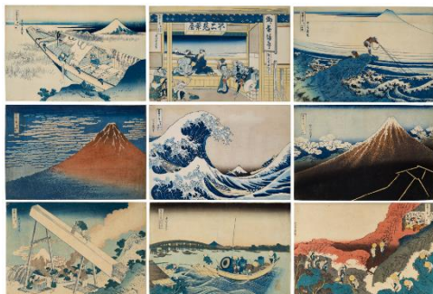
Property from a Prominent West Coast Collection KATSUSHIKA HOKUSAI (1760-1849) Fugaku sanjurokkei (Thirty-six views of Mount Fuji)