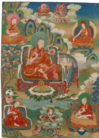
A PAINTING OF NGOR ABBOTS EASTERN TIBET, 18TH CENTURY