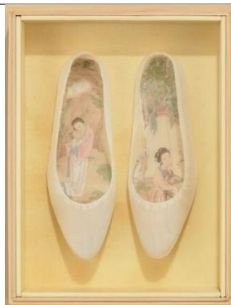
PENG WEI (B. 1974) Good Things Come in Pairs—No. 11 Paintings in shoes, ink and color and cloth in wood box 9 in. long (each shoe) Estimate: $20,000-30,000

This Asian Art Week, Christie's is pleased to present Arts of Asia Online, a carefully curated selection spanning across India, the Himalayas, China, Korea, and Japan. The sale presents a wide selection of works across various media, including ceramics, jade carvings, lacquerware, metalwork, furniture, textiles, bronze sculpture, stone sculpture, prints, and paintings. Highlights from the sale include a selection of Chinese porcelain from the collection of Dr. Hiroshi Horiuchi, a fine selection of Japanese inro, and curated groupings of Himalayan bronze sculpture and Indian court paintings from prestigious private collections. With a wide range of estimates, Arts of Asia Online presents opportunities for both burgeoning and established collectors of Asian art.