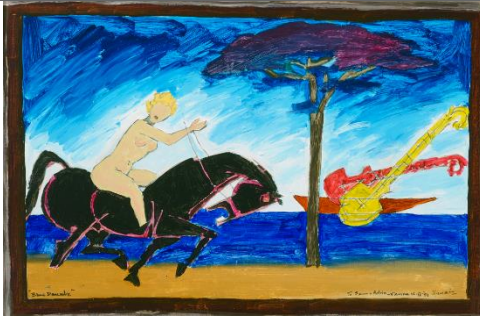
MAQBOOL FIDA HUSAIN (1913-2011)

Landscapes of Japan: Woodblock Prints from Edo to Post-War is open for bidding online from 13-26 March. The sale features works by the grand masters of Japanese woodblock prints on landscape, from Katsushika Hokusai and Utagawa Hiroshige to Kawase Hasui and Yoshida Hiroshi.