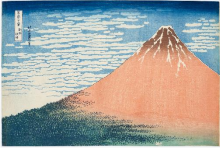
KATSUSHIKA HOKUSAI (1760-1849)

Gaifu kaisei (Fine wind, clear weather) ["Red Fuji"]