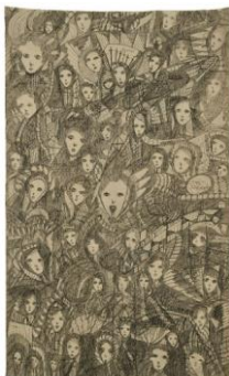
MADGE GILL (1884-1961) UNTITLED (VENUS AMID HEAVEN) ink on cloth 57 x 34½ in. $30,000-40,000