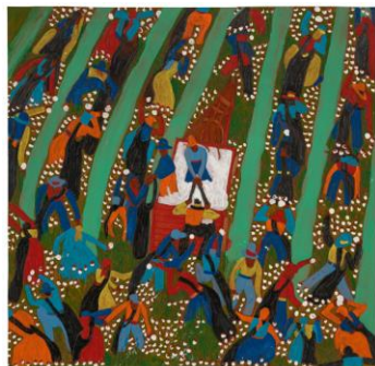
WINFRED REMBERT (1945-2021) WEIGH YOUR COTTON dye on carved and tooled leather 30¾ x 31½ in. Executed in 2013. $70,000-100,000